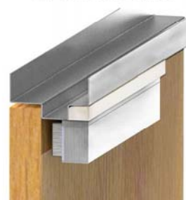
B1004 / B1005