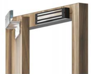
B1200 - L&Z Bracket