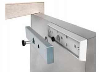
B0001A - Armature Plate Housing