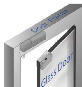
U-200 / UG201